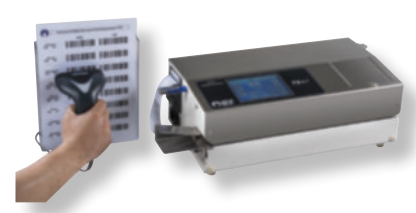
TS 47T sealer with SCANNER and USB & PRINTER options