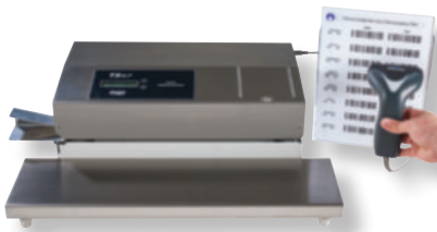
TS 47 sealer with SCANNER option