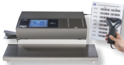
TS 47T sealer with SCANNER and stainless steel support tray