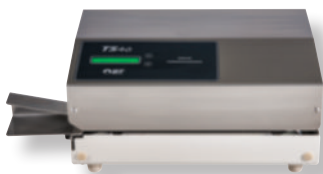
TS 46 sealer