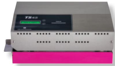
TS 45 sealer